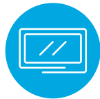
Gaskets & Seals