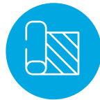
Blankets & Cloths